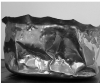
Water bowl destroyed by a pit bull