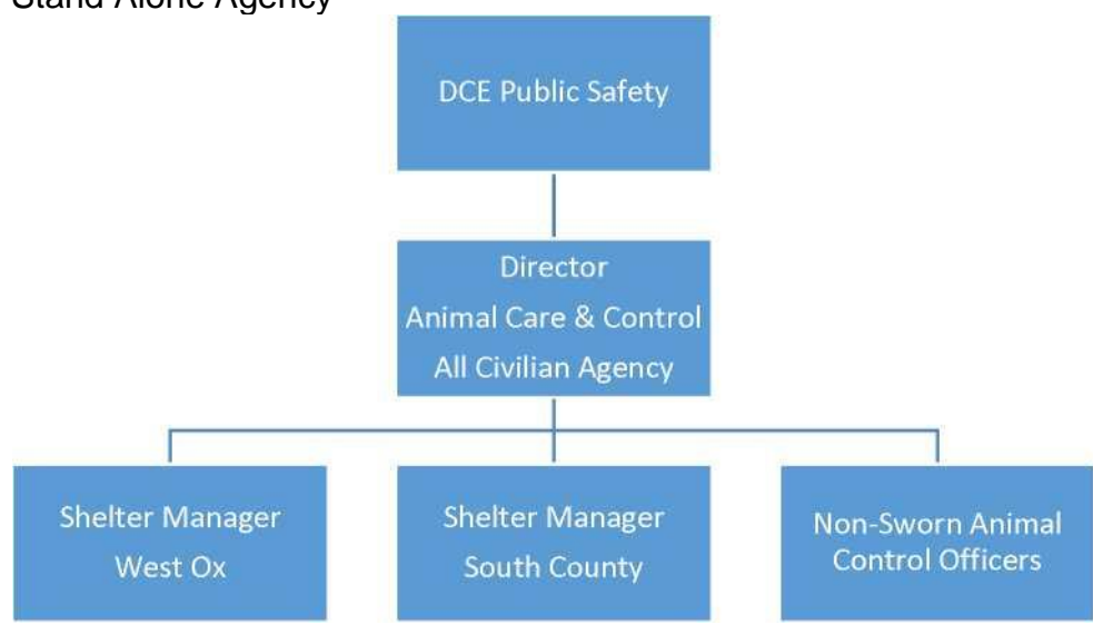
Option 2: Stand Alone Agency