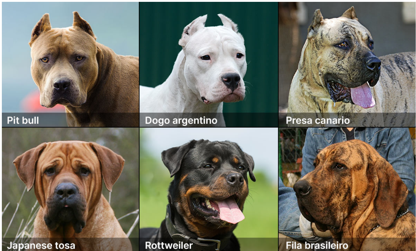
Photographs of the most frequent dangerous dog breeds restricted by governments worldwide.

enacted in 2001 , banned multiple fighting breeds: Pit Bull Terrier, American Staffordshire Terrier, Dogo Argentino, Fila Brasileiro (Brazilian Mastiff), Japanese Tosa, and their cross breeds. The following year, the Constitutional Court of the Republic of Latvia overturned the regulations stating the dog breeds could only be added to the Animal Protection Law. 240,241 In December 2001 , the capital of Honduras, Tegucigalpa, banned the American Pit Bull Terrier. Mayor Vilma de Castellanos said, "It is essential to control these dogs, which have caused such damage, pain and sorrow among the residents of the capital." Tegucigalpa and its surrounding villages encompassed 2 million people then. It is unknown if the law is still in effect. 242 When the United Kingdom passed the Dangerous Dogs Act 1991 , presumably all British overseas territories did as well. Currently, the dangerous dog laws, import requirements and territory status for the British territories of Anguilla, British Virgin Islands, Montserrat and Falkland Islands have not been researched for this document. 243